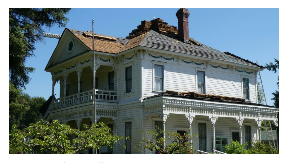
In the process of tearing off old shingles and installing new, cedar shingles, original skipjack boards were exposed on the east side of the Neely Mansion roof, 2023.