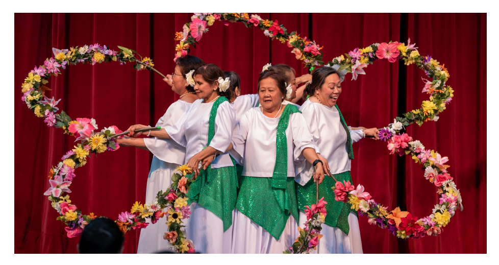
The Filipiniana Multicultural Dance Troupe performing at the Pagdiriwang Philippine Festival, Seattle Center Festál, 2023.