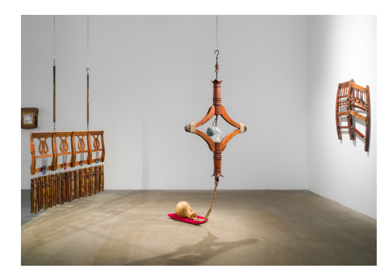
Hugo Moro. In the Current, 2023. Installation view. Gallery 4Culture.