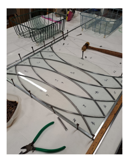
Window restoration work at the Bereiter House, home to the Greater Kent Historical Society and Kent Museum, 2023.