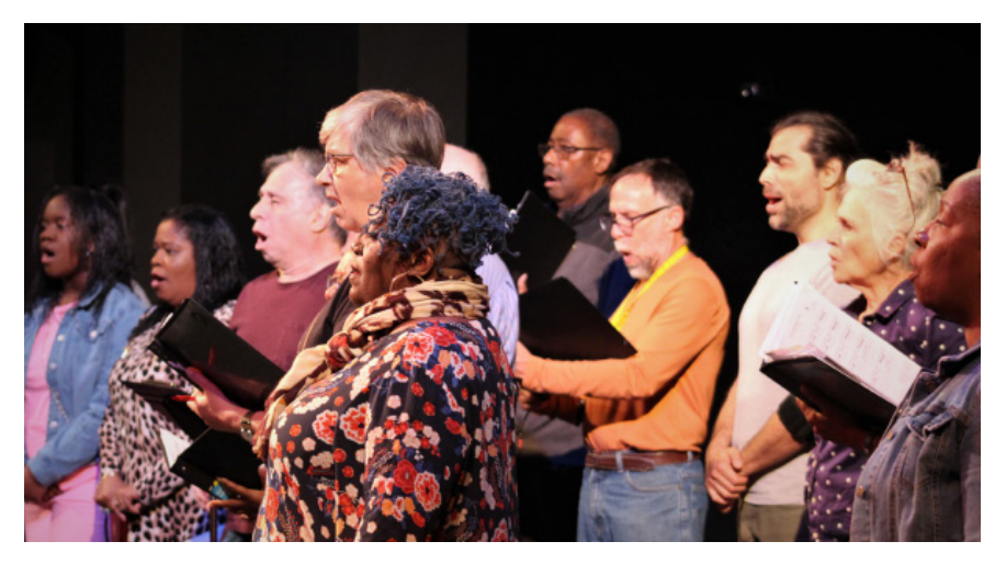
The Sound of the Northwest utilizing performance and rehearsal space at Seattle JazzED through Building for Equity's Cultural Space Partnership program, 2023.

Doors Open promises to be transformative for our entire sector. While our organization may look very different by the time we publish our 2024 Annual Report, the work highlighted here and planned for the year ahead is true to the 4Culture you know: broad support for the cultural doers of King County, capacity-building initiatives, and always working to make King County a more vibrant place.