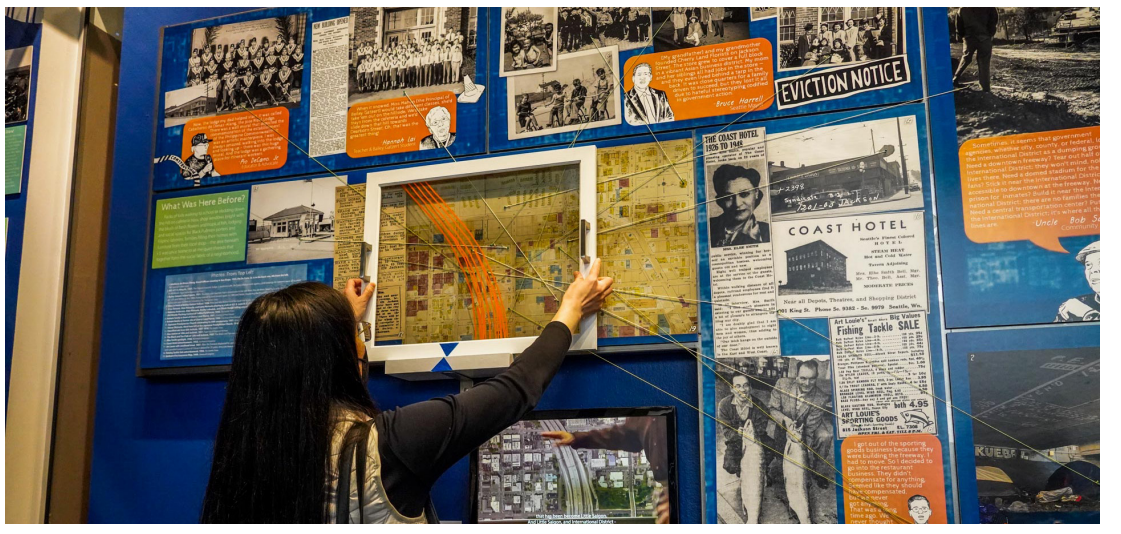
Nobody Lives Here, exhibition at Wing Luke Museum of the Asian Pacific American Experience, 2023.