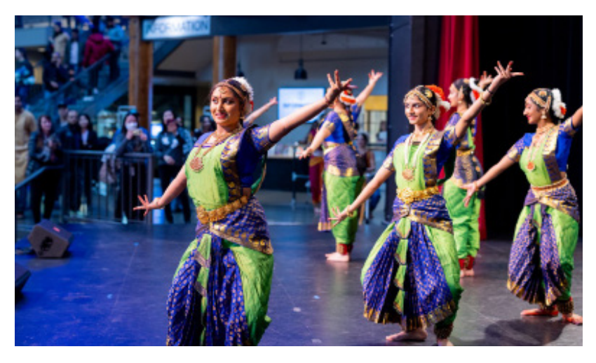
Dancers performing at Diwali: Lights of India, a cultural showcase organized by Northwest Share, 2023.

Since 2019, 4Culture has tracked and analyzed demographics for all applicants and awardees. This is one of several ways to work to meet our mission to fund, support, and advocate for culture with a focus on racial equity. Every year we review the outcomes of our funding to better understand our impact and strategize ways to improve.