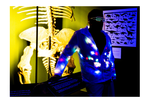
Art a Glow at the Highline Heritage Museum, 2023.