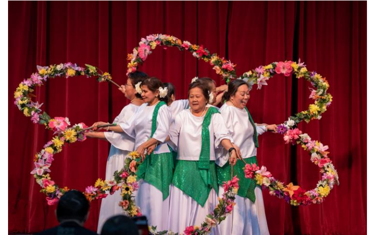
The Filipiniana Multicultural Dance Troupe performing at Pagdiriwang Philippine Festival, Seattle Center Festival.

Reduce the significant barrier that admission fees pose to many King County residents, particularly underserved communities, and visitors in accessing quality, relevant, cultural and science experiences