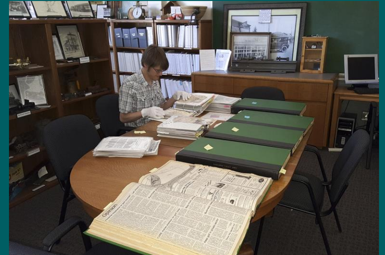
Archival Intern at work.

This priority ensures this funding impacts individual cultural practitioners.