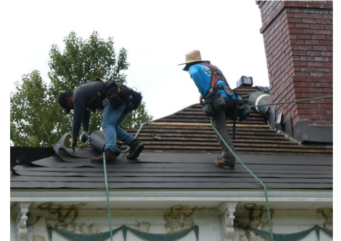
Neely Mansion restoration in action, new overlapped felt-paper rolled out on top of original skip jack boards.

Grants may be used to support free and reduced cost participation in cultural and science experiences